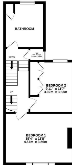
1ST FLOOR 468 sq.ft. (43.5 sq.m.) approx.