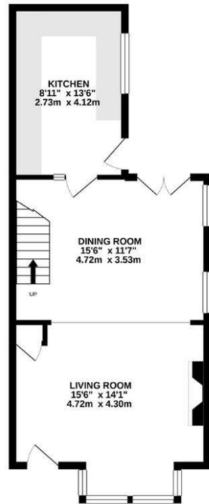
GROUND FLOOR 492 sq.ft. (45.7 sq.m.) approx.