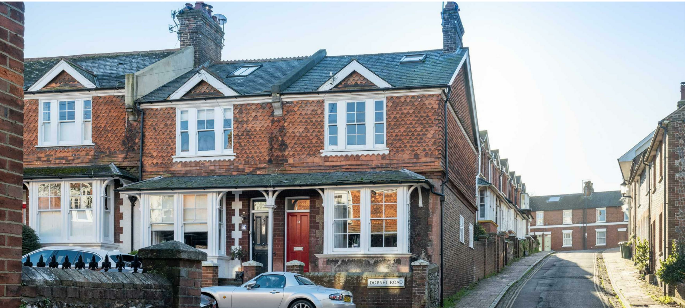
Dorset Road, Lewes